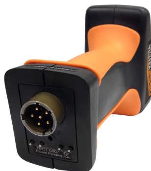
SD Card included

With an intuitive design to pick up and go, STATIX is the essential tool to know your power.